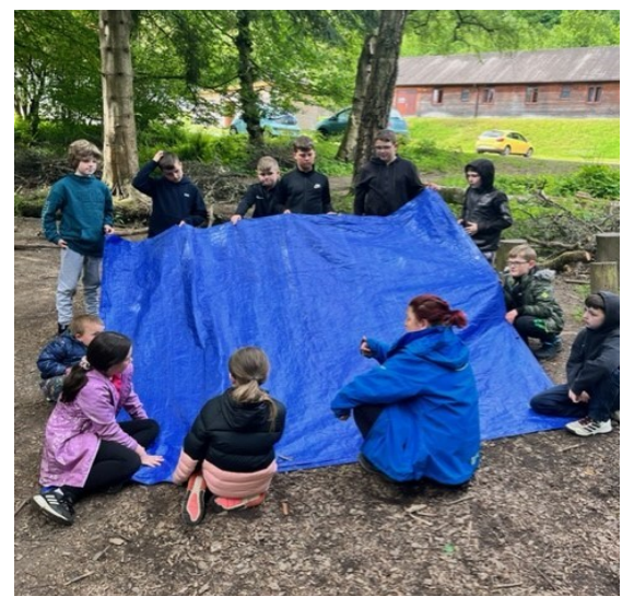
BB & GB members under canvas at Dalguise