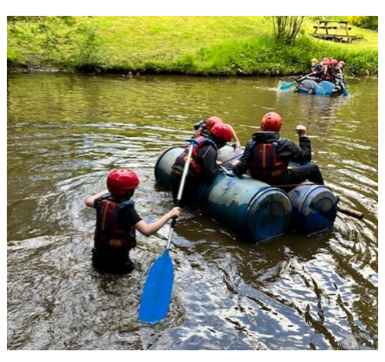
And under water by the look of it!