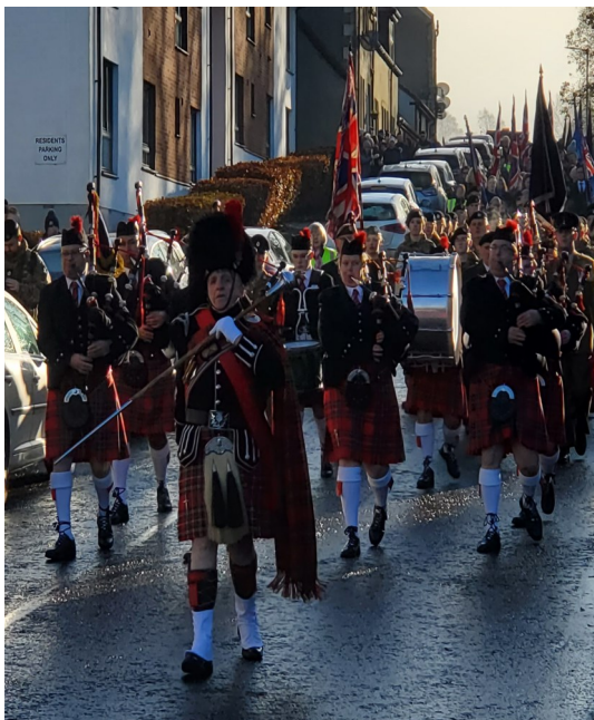
Remembrance Day 2023— Above: the Boys' Brigade & Girls' Brigade, The Pipe Band leading the parade. Below: Army cadets and the BB flag bearers