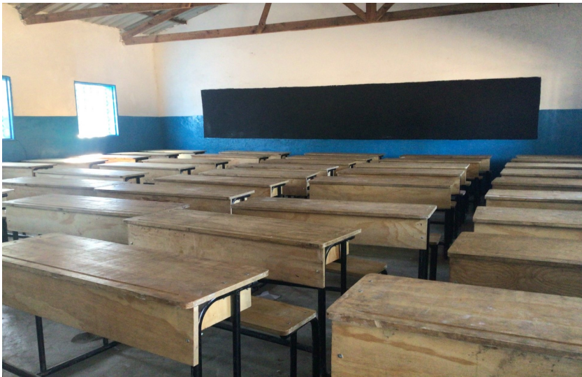
The finished article—looking spick and span with clean walls, a blackboard and neat rows of desks.