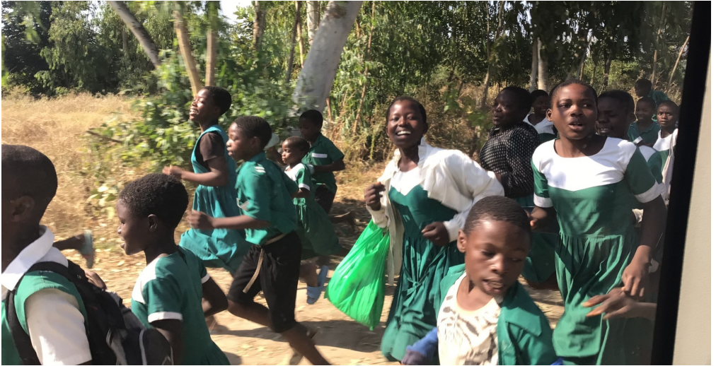
Children ran for about a mile alongside the minibus to welcome us.

The BB trip to Malawi was a once in a lifetime experience for the boys. We heard last time a bit about the travel and challenges that had to be overcome. This time we share some photos taken at the school and of the work in progress.